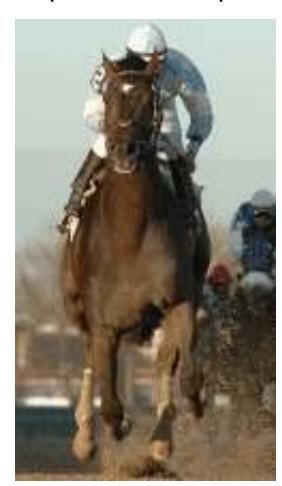
Nobiz Like Shobiz

Nobiz Like Shobiz (Albert the Great) and Showing Up (Strategic Mission) both ended their 2006 campaigns in style and will spend the winter months at Barclay