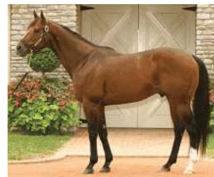
Yes It's True threechimneys.com

Cape Canaveral, back down to $7,500 for next year. He was fifth on that hot 2004 freshman sire list, and has gone on to record a 2.81 mid-year A Runner Index, and 2.60 for two-year-old ABC Runners. He has five SWs and the earners of $2.2 million this year, and I just think he has good numbers for a sire at this stud fee level.