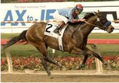
Da Stoops

Next Tuesday's GI Malibu S. at Santa Anita will have added significance for Da Stoops (Distorted Humor--Glamorous Lady, by Kingdom of Spain), as the three-year-old colt looks to end his racing career with a bang in the seven-furlong opening-day feature. Yesterday, Stonewall Farm announced that it had agreed to purchase Da Stoops, winner of the Sunshine Millions Dash S. earlier this year, and will stand the four-time stakes