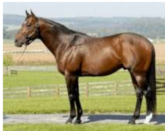
Gators N Bears, who now stands at Maryland Stallion Station marylandstallions.com

We can kick off with the first graded stakes winner from Stormy Atlantic's first crop, Atlantic Ocean. This $1.9-million two-year-old-in-training sales purchase is out of a mare by Seattle Slew. Since Stormy Atlantic is