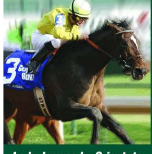
Lady Joanne by Orientate winning the Golden Rod-G2 at Churchill on 11-25