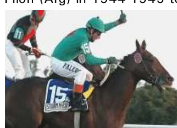
Storm Mayor hipodromosanisidro.com

Stud Starlight's Storm Mayor (Arg) (Bernstein) became just the sixth horse overall and the first since Filon (Arg) in 1944-1945 to register back-to-back victo-