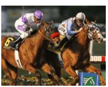
Stormello (inside)