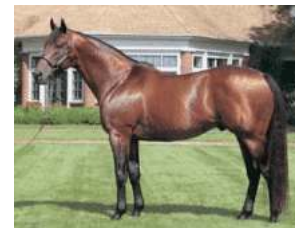
Lemon Drop Kid