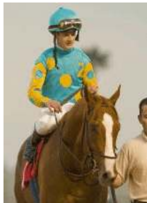
Belgravia