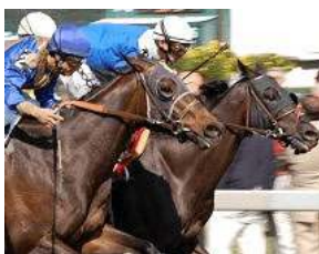
Dreadnaught (outside)