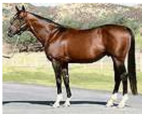
General Meeting (1988-2006) Golden Eagle photo