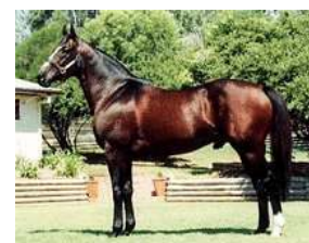
Iglesia (1995-2006)

IGLESIA EUTHANIZED Leading young sire Iglesia (Aus) (Last Tycoon {Ire}--Yodells {Aus}, by Marscay {Aus}) was euthanized Dec. 11 at Oaklands Stud in Queensland, Australia. The 11-year-old stallion sustained a hind leg injury last month and recently developed complications. He had stood for A$22,000 this year. Winner of the G2 Silver Slipper S. at two, the half-brother to MG1SW Yippyio (Aus) set a track record of 1:07.16 for 1200 meters in winning the G3 Standish H. in 2001. He was the leading freshman sire in Queensland for 2004/05 and has been represented by five stakes winners to date, including Group 2 winners Nova Star (Aus) and Written Tycoon (Aus).