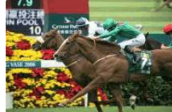
Kastoria (outside)