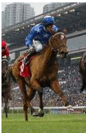
Pride

NB Bloodstock's Pride (Fr) (Peintre Celebre--Specificity, by Alleged), who closed out her career with a thrilling victory in last Sunday's G1 Cathay Pacific Hong Kong Cup, will be bred to leading sire Monsun (Ger) in 2007, according to www.galopponline.de . Monsun,