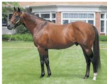
Kingmambo

By Seattle Slew out of the Riva Ridge mare Hedgeabout, Slewvera was bred on an identical cross to Life at the Top, a six-time graded-stakes winner whose victories included the GI Ladies H. and GI Mother Goose S. Hedgeabout was also a talented performer in her own right, winning 10 races, including the listed Berlo H. She earned placings in eight other stakes events, most notably when second in the GIII Interborough H. Hedgeabout's dam Roundabend was unraced, but she was a half-sister to three stakes winners, headed by the prolific Sonny Says Quick, winner of 24 races, including 14 black-type events; and to that horse's stakes-placed sister, Free to Fly (subsequently the dam of champion Fly So Free).