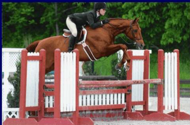
"Buster" was rescued by the TRF from New Holland in 2002.

© Copyright Thoroughbred Daily News. This newspaper may not be reproduced in any form or by any means, electronic or mechanical, without prior written permission of the copyright owner, MediaVista. Information as to the American races, race results and earnings was obtained from results charts published in Daily Racing Form and utilized here with the permission of the copyright owner, Daily Racing Form.