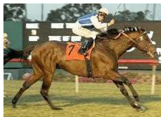
Boboman

The first U.S. Grade I winner for Kingmambo was Lemon Drop Kid, a son of a mare by Seattle Slew. Eight years on that same cross is also responsible for Kingmambo's most recent Grade I winner, Boboman, who captured the GI Hollywood Turf Cup Saturday. Whereas Lemon Drop Kid took the GI Futurity S. in only his fourth start, Boboman's owner/breeders,