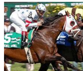
Rebel Rebel