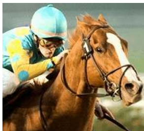
Belgravia