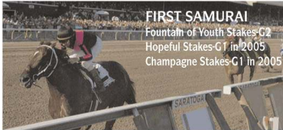
FIRST SAMURAI Fountain of Youth Stakes-G2 Hopeful Stakes-G1 in 2005 Champagne Stakes-G1 in 2005