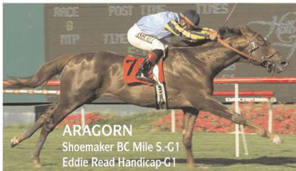
ARAGORN Shoemaker BC Mile S-G1 Eddie Read Handicap-G1