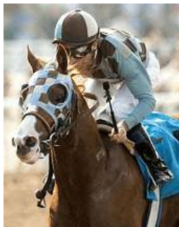
Stormello