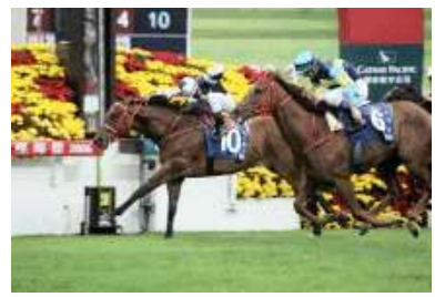
The Duke gets his Group 1

Third in the 2004 running and second last year, The Duke proved third-time lucky, sitting a perfect trip from the box seat before holding off Armada. A graduate of the 2001 Hong Kong International Sale, the seven-year-old ventured overseas for the first time last June, but could do no better than 15<sup>th</sup>, beaten over nine lengths, to Bullish Luck (Royal Academy) in the G1 Yasuda