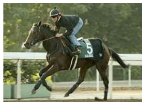
Ouija Board

Fifth in the G1 Coral-Eclipse S. July 8, Ouija Board emerged as the winner in a thrilling battle with Alexander Goldrun (Ire) in the G1 Nassau S. at Glorious Goodwood Aug. 5 before succumbing late to Dylan Thomas (Ire) in the G1 Irish Champion S. Sept. 9 at Leopardstown. She then earned her second Breeders' Cup title in the F/M Turf before heading to Japan, where she ran a gallant third to Deep Impact (Jpn) in the G1 Japan Cup Nov. 26 in what would be her final trip postward. In all, Ouija Board compiled a record of 22-10-3-5 with earnings of £3,510,682 ($5,102,985), just £160,000 shy of Singspiel's mark for a horse bred in Great Britain.