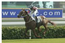
Hello Pretty