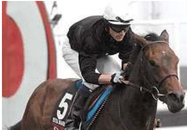
Ouija Board

Globetrotting star Ouija Board (GB) (Cape Cross {Ire}--Selection Board {GB}, by Welsh Pageant {Fr}) exhibited soreness in her left front leg yesterday and was withdrawn from today's G1 Cathay Pacific Hong Kong Vase. The 2400-meter race, in which the five-year-old would have been favored to defend her title, was to have been her final career start, and she has been retired.