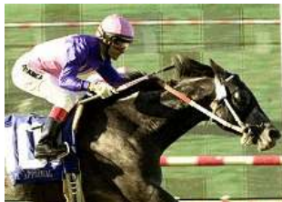
T.H. Approval

T.H. Approval (With Approval) has enjoyed a solid 2006 campaign. Kept exclusively in Grade I and Grade II company, he won his second straight GII San Juan Capistrano Invitational H. in April and captured in consecutive starts the GII Sunset BC H. and GII Del Mar H.