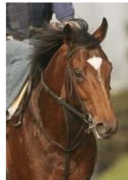
Ivan Denisovich