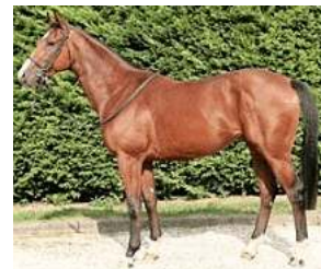
Lot 15 www.hkjc.com