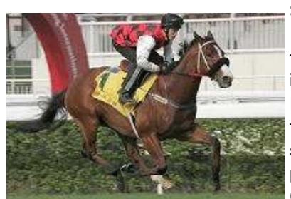
Takeover Target HKJC.com

The Hong Kong Jockey Club yesterday put out a release indicating that samples drawn from G1 Hong Kong Sprint favorite Takeover Target (Aus) (Celtic