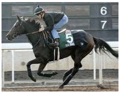
Ouija Board

British bookmakers have installed Ouija Board (GB) (Cape Cross {Ire}) the early 13-8 favorite for her career finale in Sunday's G1 Hong Kong Vase, but despite