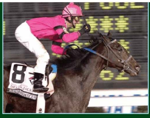
2yo Graded SW BIRDBIRDISTHEWORD one of five 1st crop stakes winners by PURE PRIZE