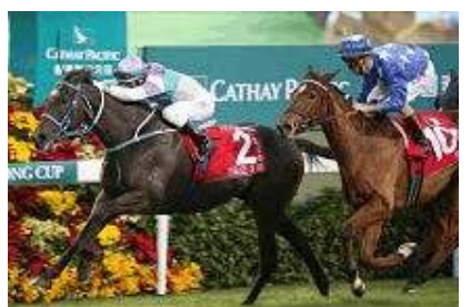
Vengeance of Rain defeating Pride in the 2005 Hong Kong Cup

Last year's G1 Hong Kong Cup hero Vengeance of Rain (NZ) (Zabeel {NZ}) tuned up for Sunday's title defense by working 800 meters in 46.9 over the turf at