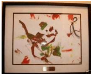
"Moneigh" by Cigar eBay.com

ReRun Inc., the nonprofit Thoroughbred adoption group, announced yesterday that it has placed 30 "Moneigh paintings" by racehorses in its annual holiday auction on eBay. The auction will run between Dec. 3-10. The paintings are made by famous racehorses using their muzzles, lips, whiskers and tails, and include a hoof print, a lock of mane and a brass name plate. This year's equine artists include Cigar, Da Hoss, Funny Cide, Holy Bull, John Henry (signed by Chris McCarron), Lava Man,