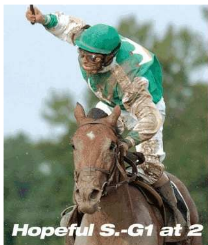
Hopeful S.-G1 at 2