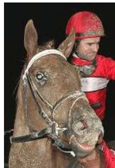
Miss Atlantic City

Miss Atlantic City closed from far back to place second in her Evangeline debut July 15, then earned her diploma in the John Franks Memorial Sales S. at that track Aug. 4. Trying the turf in her next start at Retama Sept. 2, she crossed the line third in the La Senorita S. Freshened up following that performance, the chestnut resurfaced to place third behind GI Matron S. victress Meadow Breeze (Meadowlake) and Stage Stop in Delta's My Trusty Cat S. Nov. 3. Placed in a perfect spot by Kent Desormeaux as Appealing Zophie and Meadow Breeze locked horns through :22.62 and :46.33 fractions, Miss Atlantic City turned up the pressure entering the final turn and fought her way past the heavy favorite to secure the victory.