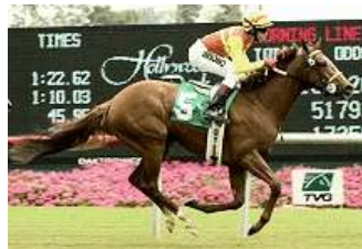
Foxysox