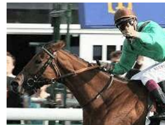
Mandesha, whose dam Mandalara sells today France Galop