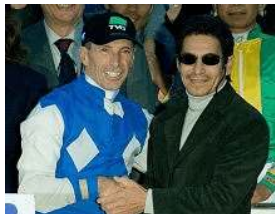
Baze & Pincay

The 48-year-old Hall of Famer Russell Baze became the winningest jockey of all time yesterday, notching his 9,531st career victory at Bay Meadows. Baze tied Laffit Pincay Jr.'s mark of 9,530 at the track Thursday, then earned the milestone in yesterday's fourth race, guiding Butterfly Belle to a 2 1/4-length victory in a turf claiming race. Facing a wall of horses in the stretch, Baze sent the four-year-old filly up the rail and she burst clear for the record-breaking victory. An elaborate winner's circle celebration immediately followed, and Baze, after achieving what undoubtedly will be one of the most enduring accomplishments in racing, was typically modest. "Who would've thought 32 years ago a skinny little kid with no experience would be standing here today?" asked Baze, who stood alongside Pincay. Pincay had been at Bay Meadows since Saturday in anticipation of Baze breaking the record. "He's been extremely gracious," said Baze. "There's not a greater rider in the history of horse racing." Cont. p4-5