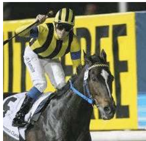
Heart's Cry in Dubai

HEART'S CRY RETIRED Heart's Cry (Jpn) (Sunday Silence--Irish Dance {Jpn}, by Tony Bin {Ire}), the lone horse to defeat Deep Impact (Jpn) on Japanese soil in the 2005 Arima Kinen, has been retired from racing following his 10th-place finish to that archrival in last