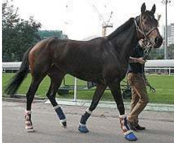
Ouija Board arrives in Hong Kong