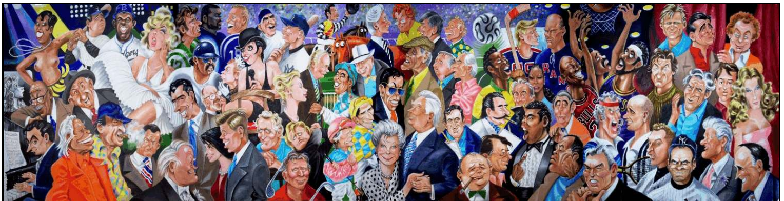
The New Peb Mural at Gallagher's Steak House in New York City

Thanks to those who have helped Gallagher's raise over $6,000 for the TRF this year!