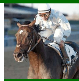
NOBIZ LIKE SHOBIZ

ALBERT THE GOLD won the Clasico Agustin Mercado Reveron- G1PR .