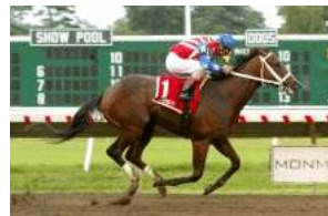
Praying For Cash