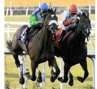
G1 Florida Derby

His awesome runner-up performance against Barbaro in the $1-million G1 Florida Derby, in which he posted a triple-digit Beyer Speed Figure, confirmed him in our minds as one of the most talented three year olds of his generation. Unfortunately, Sharp Humor sustained an injury in the Kentucky Derby which precluded us from seeing the full extent of this horse's talent. We are excited to be standing such a promising son of Distorted Humor, and are equally as excited to have Taylor Made as a partner in what is the newest Taylor Made/WinStar Venture Stallion." Sharp Humor retires with four wins from 10 starts and $490,410 in earnings. His stud fee will be announced at a later date.