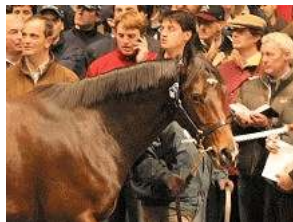
Magical Romance

Sometimes the formula really is that simple: pedigree plus performance equals big price. Magical Romance