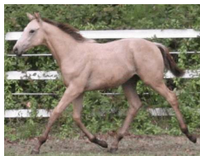
True Buckskin Halo

The first genetically certified buckskin-colored Thoroughbred to go to public auction will be offered as Hip 407 at the Fasig-Tipton Midlantic Winter Mixed Sale in Timonium, Maryland Dec. 4, according to her breeder.