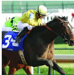
Lady Joanne by Orientate winning the Golden Rod-G2 at Churchill on 11-25

Donna Blini, a bargain 20,000gns DONSEP yearling, won three of her four starts at two, capping the campaign with a victory in the G1 Cheveley Park S. She was entered in this sale last year, but was withdrawn. A disappointing sophomore season saw her win just once in seven tries, taking a conditions race at Newmarket in July, but she still boosted earnings of £175,816 substantially at Tattersalls yesterday.