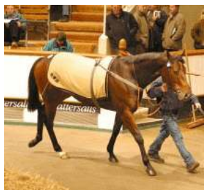
La Cucaracha