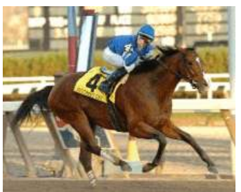
Discreet Cat

Tired but otherwise no worse for wear a day after his record-setting victory in the GI Cigar Mile, Godolphin's Discreet Cat (Forestry) will now get a little break before gearing back up for the G1 Dubai World Cup in March.