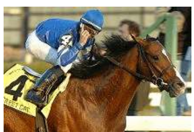
Discreet Cat D Alcosser photo

He had never been truly tested, and he was the 124pound highweight despite facing a pair of talented older