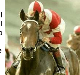
Mea Domina

two straight. She outfinished Clinet by a head to capture the one-mile GII Las Palmas H. at Santa Anita