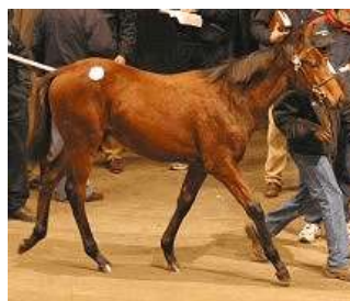
Lot 1207

SADLER'S WELLS COLT TOPS TATTS Yesterday's record-breaking penultimate session of the Tattersalls December Foal Sale saw an amazing 42 six-figure transactions. Leading the way was hip 1207, a 420,000gns Sadler's Wells half-brother to the dual G1 winner Landseer (GB). He was bred by Rockwell Bloodstock and sold from the Swinburn family's Genesis