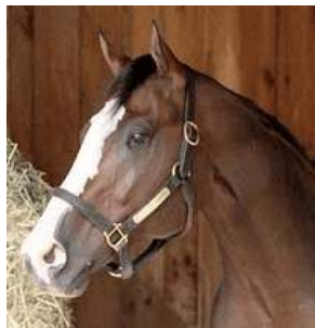
The Green Monkey

The Green Monkey (Forestry), who set a world record when he was purchased for $16 million at the Fasig-Tipton February Sale at Calder, will not make his debut until next year, the Daily Racing Form reports. The two-year-old was sidelined after injuring a gluteal muscle over the summer, and reagravated that injury this fall. He has been shipped to his owner's Ashford Stud in Kentucky for a break. "We sort of ran out of time at Aqueduct, so we're going to point for a Florida campaign," trainer Todd Pletcher told DRF. "We'll give him a little bit of time off."