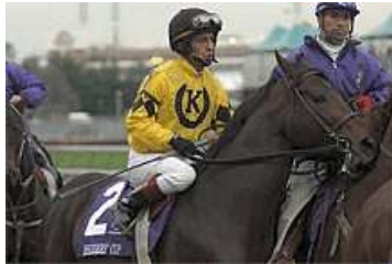
Premium Tap heads to the post for the BC Classic CDI photo

Coming off his excellent third-place effort to Invasor (Arg) and Bernardini in the GI Breeders' Cup Classic at Churchill Nov. 4, Premium Tap (Pleasant Tap) penned