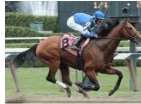
Discreet Cat A Coglianese

Forty horses have taken a crack at Godolphin's undefeated Discreet Cat (Forestry) and the closest any one of them has gotten to the blaze-faced bay colt at the finish is 3 1/2 lengths. That is likely to change this