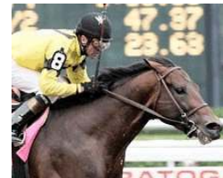
Premium Tap