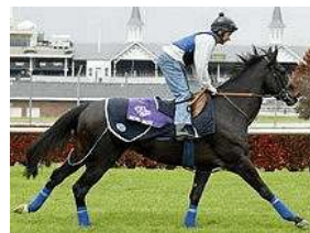
Rob Roy