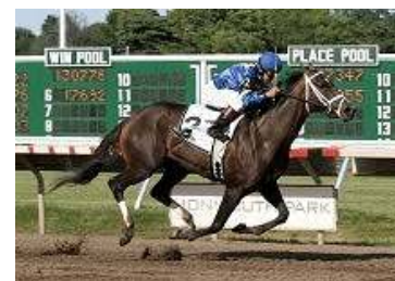
Mo Cuishle