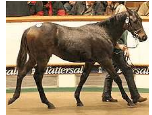
Wednesday's top lot - Kyllachy colt