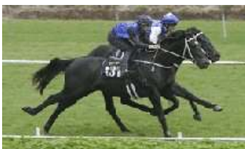
Sales-topping hip 131 (near side) nzb.co.nz

for gross receipts, average and median. A total of 197 juveniles were reported as sold for a turnover of NZ$9,866,750, a 10-percent increase on 2005, despite fewer horses being sold. The average of NZ$50,085 was better by 15 percent versus a year ago, while the median