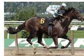
Nobiz Like Showbiz