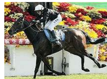
Ouija Board winning in 2005