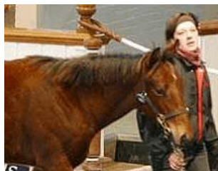
Lot 491 - Dansili colt