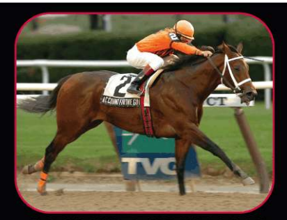
ACCOUNTFORTHEGOLD took the Stuyvesant H.-G3 wire-to-wire

Sire of 11 stakes winners, 45% at a mile or more