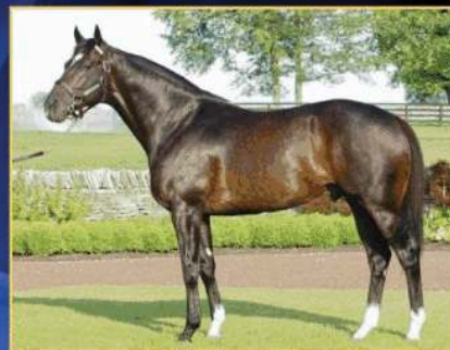
MEDAGLIA D'ORO America's NEXT Premier Sire