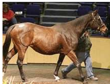
Hip 1363

Following the resounding success of the five days of foals at Goffs November, the momentum was maintained as the action switched to broodmares and fillies yesterday. Twelve months on from the €1-million paid for one of His Highness the Aga Khan's finest broodmares Dalara (Ire), it was the same breeder's draft