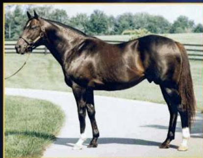
STORM CAT America's Premier Sire

GIII Stuyvesant H. Accountforthegold (Successful Appeal) leads a 1-2-3 sweep for NY-breds.