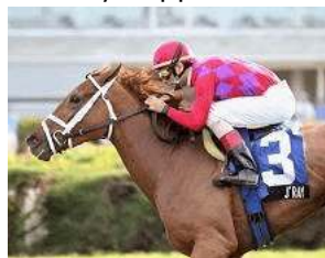
J'ray

Unbeaten going 1 1/16 miles on the grass, J'ray (Distant View) looks to keep that record intact in today's GII Mrs. Revere S. at Churchill Downs. The chestnut filly capped a four-race winning streak in the Jan. 1