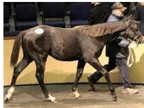
Hip 1072