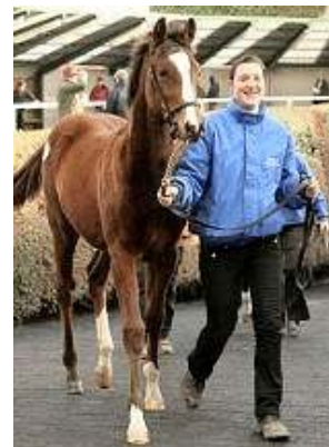
Hip 998 www.goffs.com

It was a tumultuous final session of the foal section of the Goffs November Sale yesterday, with the average rising more than 20 percent and the median showing an increase of 48 percent on 12 months ago. Just last year, a strong last day saw the average soar by 71 percent on the 2004 session equivalent, resulting in a 44-percent increase in average over the five days, but that achievement was put in the shade by record trade yesterday. Last year's gross, €17,711,200, was surpassed by nearly €6 million, and a total of 35 foals made €100,000 or more. Managing