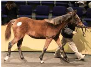
Hip 837, yesterday's topper at Goffs