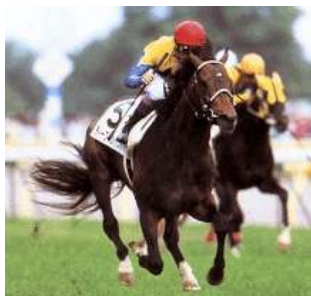
Deep Impact