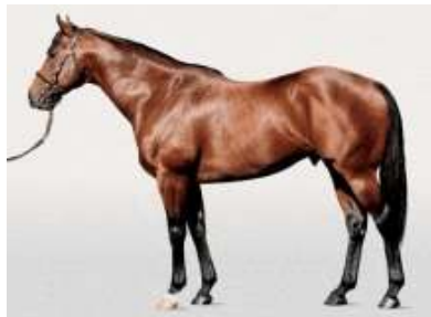
Darley's Exceed and Excel www.darleystallions.com