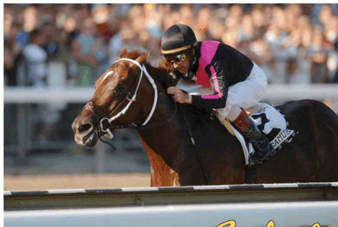
$40,000 live foal

GIANT'S CAUSEWAY - FREDDIE FRISSON, BY DIXIELAND BAND