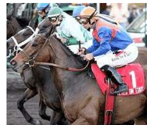
Eyes on Eddy