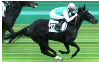
Passage of Time

Tradition dictates Henry Cecil's Warren Place standard be unfurled to herald each Group 1 success, but the flag had not been hoisted in over six years. However, the ceremony is in vogue once more after Juddmonte Farms' aptly named 15-1 chance Passage Of Time (GB) (Dansili {GB}) stepped up