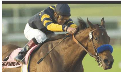
G1 SW BEHAVING BADLY , by PIONEERING , sire of 21 Stakes Horses and earners of over $3.5 million in 2006.

12 SWs in 2006 PIONEERING (Mr. Prospector - Terlingua, by Secretariat) 2007 Fee: $5,000 stands & nurses