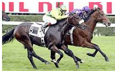
Spirit One (shadow roll)

Europe's final Group 1 race of the season, today's G1 Criterium de Saint-Cloud, has attracted its largest field since Magistros (Fr) beat 14 rivals in 1986. The two-horse home team may be short on quantity, but Spirit One (Fr) (Anabaa Blue {GB}) has the necessary quality to prevent the prize going abroad for the fourth time in six years. His impressive winning streak was halted when he was outbattled by Mount Nelson (GB) in the Oct. 29 G1 Criterium International over this course, but that encounter will stand the habitual frontrunner in good stead and he holds strong claims for a victory here. Aidan O'Brien saddles both Soldier of Fortune (Ire) (Galileo {Ire}) and Red Rock Canyon (Ire) (Rock of Gibraltar {Ire}). Kieren Fallon takes the mount on the former, who improved off a debut second at Gowran Oct. 6 to bag a Navan maiden last time Oct. 17. Fellow Ballydoyle incumbent Red Rock Canyon was a last-out eighth in the Oct. 21 G1 Racing Post Trophy at Newbury. Cont. p6