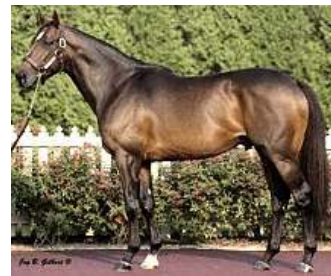
Action This Day