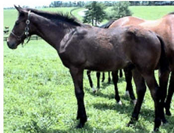
Street Sense as a foal