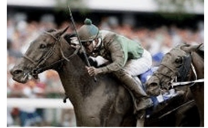
Friel's For Real