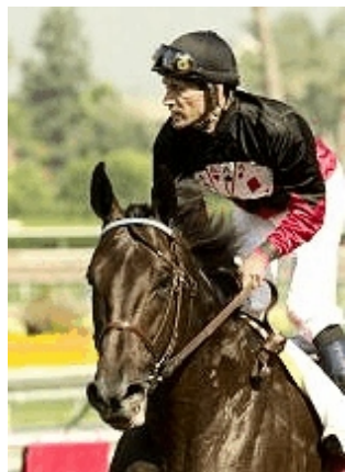
Rock Hard Ten