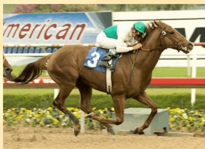
HIT AND HOPE