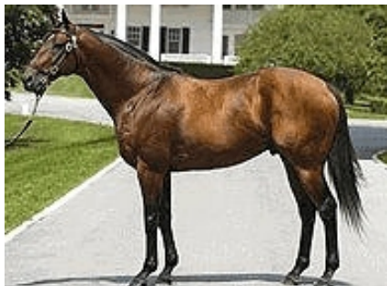
Perfect Soul

Darby Dan's first-crop sire Perfect Soul (Ire) (Sadler's Wells) got off to a tremendous start in the sales ring, as his very first two horses to go under the hammer sold