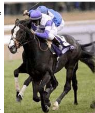
Red Rocks

Galileo's second crop has already produced Teofilio, a two-time Group 1 winner who is almost certain to be ranked as Europe's best two-year-old. Red Rocks is out of the Irish black-type winner Pharmacist, a daughter of Machiavellian, who thus appeared as grandsire and maternal grandsire of a Breeders' Cup winner. The second dam, Pharaoh's Delight, a daughter of Fairy King, was an extremely speedy and precocious filly, who won the G1 Phoenix S. and G3 Princess Margaret S. and also earned places in four other Group 1 events.