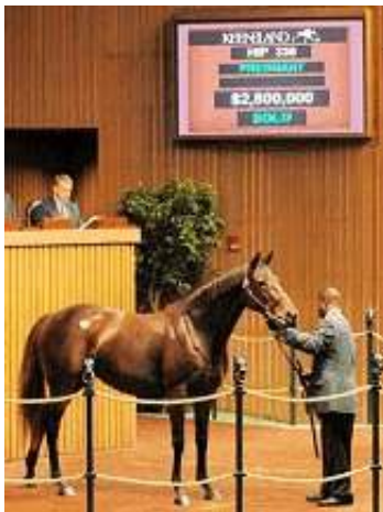
Because (Ire) Tops Tuesday

The first fireworks of yesterday's session were set off about an hour into bidding when Because (Ire) (Sadler's Wells), a full-sister to Irish champion Quarter Moon (Ire) and G1 Irish 1000 Guineas winner Yesterday (Ire),