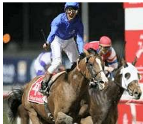
Electrocutonist (2001-06)