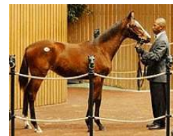
Gone West-Islington filly