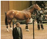
Madcap Escapade

On the track, few could catch Madcap Escapade (Hennessy). The dismayed competition usually struggled to keep pace as the daughter of Hennessy seemed always out of reach.