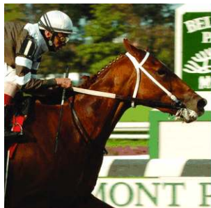
Gainesway's Successful Outlook by Orientate wins Tempted S.-G3 by 1 1/2 L. Now 2 wins in 2 starts.

You can also pick up a copy of the TDN today at the Keeneland November Breeding Stock Sale.