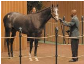
Half Ours