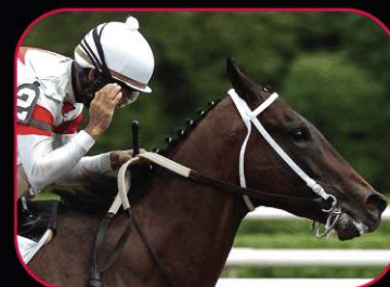
GI 2YO Appealing Zophie

THE VERDICT - SUCCESSFUL APPEAL #1 ON ALL COUNTS