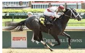
Half Ours