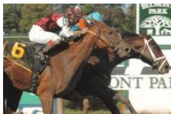
Balletto (outside) A Coglianese

Darley's Balletto (UAE) (Timber Country) continues to train well and went five furlongs yesterday in a solid 1:02 1/5 at Belmont Park. "Balletto is doing really well,"