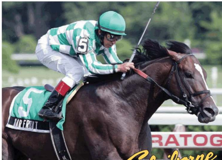
New for 2007