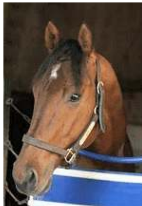
Attila's Storm

Let go at 45-1 in last year's GI Breeders' Cup Sprint, Barry Schwartz and Wachtel Stable's Attila's Storm (Forest Wildcat) ran a very credible fourth--beaten 3 1/4