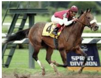
Dubai Escapade