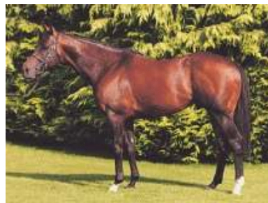
Invincible Spirit www.irish-national-stud.ie

Surprise, surprise--the Danzig male line was again in the news in Europe over the weekend, with the G1 Criterium International falling to Mount Nelson, a colt