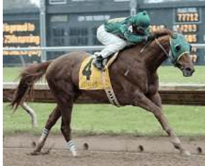
Alumni Hall