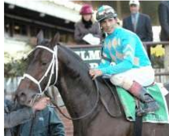
Scat Daddy