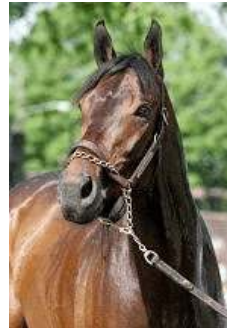
A.P. Warrior

A.P. WARRIOR TO STAND FOR $20,000 Multiple graded stakes winner A.P. Warrior (A.P. Indy--Warrior Queen, by Quiet American), who was retired to Stonewall Farm Stallions last week, will stand his first season at stud for $20,000, stands and nurses, it was announced yesterday.