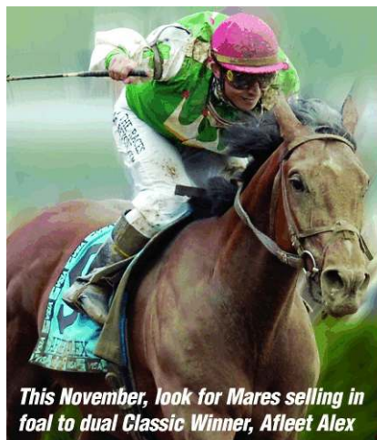
This November, look for Mares selling in foal to dual Classic Winner, Afleet Alex