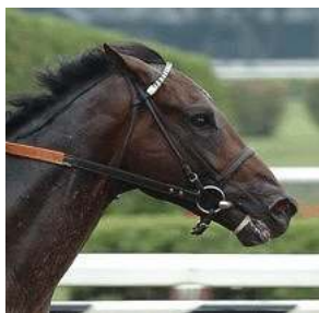
Got the Last Laugh