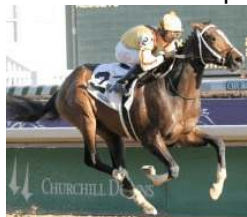
Tiz Wonderful Reed Palmer

The juveniles took center stage at Churchill Downs yesterday, with Tiz Wonderful (Tiznow) running away with the GIII Iroquois S. and Change Up (Distorted Humor) grinding out a win in the GIII Pocahontas S. two races later. Running in the colors of Jess Jackson's Stonestreet Stable, Tiz Wonderful was heavily favored yesterday off a 12 1/2-length debut romp at Saratoga. The bay was forced to steady several times when between foes leaving the chute, but moved to challenge for the lead in upper stretch before charging clear to a 6 3/4-length victory. Change Up, easy winner of the Mountaineer Juvenile Fillies S., disappointed when seventh as the favorite in the GIII Arlington-Washington Breeders' Cup Lassie S. The chestnut filly rebounded yesterday with a driving two-length victory. The time for both one-mile contests was 1:35 4/5. Cont. p5