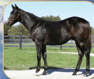
Hip 493 colt - sells Nov. 7