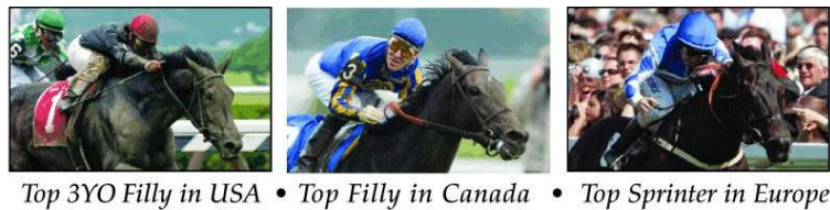
Top 3YO Filly in USA • Top Filly in Canada • Top Sprinter in Europe