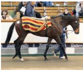
Thursday's topper Trafalgar Bay