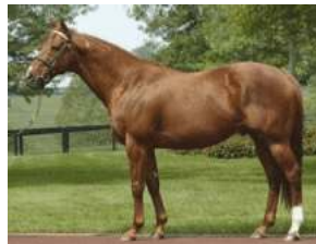
Distant View

DISTANT VIEW PENSIONED Juddmonte stallion Distant View (Mr. Prospector--Seven Springs, by Irish River {Fr}) has been pensioned on veterinary advice,