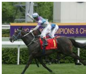
Vengeance of Rain

Vengeance of Rain (NZ) (Zabeel {NZ}), unraced since clinching the 2005 World Series Racing Championship with his victory over Pride (Fr) in last December's G1 Hong Kong Cup, returns to action in Sunday's HSBC Premier Bowl H. over 1200 meters. Winner of the G1 Audemars Piguet QE II Cup in 2005 and the restricted Hong Kong Derby, the six-year-old was diagnosed with an irregular heartbeat in the weeks following his Hong Kong Cup success and was subsequently turned out in New Zealand.