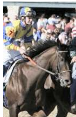
Street Sense