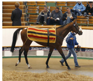
Golden Arrow