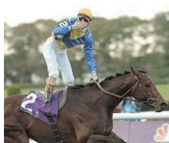
Shirocco winning the GI Breeders' Cup Turf