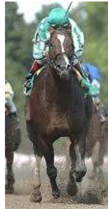
War Front