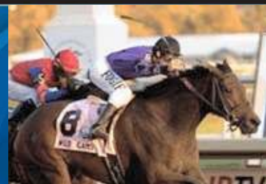
MGSW WILD GAMS

Storm Cat - Victoria Beauty, by Bold Native 2007 Fee: $35,000 Live Foal