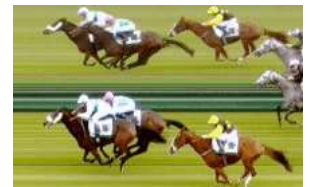
Montare game in victory