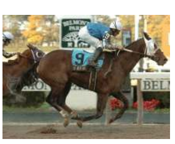
No Reason A Coglianese

No Reason was up the track in two turf tries over the