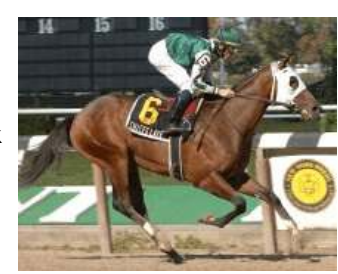
Chief's Lake

lengths in a NW1X for Empire-breds Oct. 13 and was 3-5 to extend his streak to three here. Usually vying for the lead, Chief's Lake took back a bit yesterday and conceded the front to Solid Strike. He ranged up to take control in upper stretch and cruised home a much-the-best winner. "I didn't think Solid Strike would be on the lead,