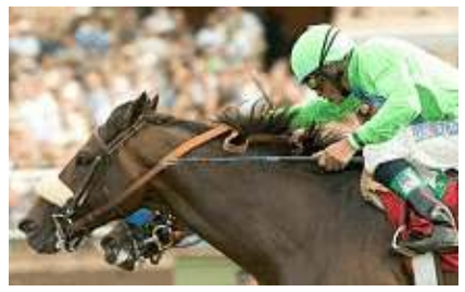
A.P. Warrior

Quiet American), a graded-stakes winner on turf and