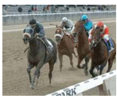
Gold and Roses outfinishes Sharp Humor (inside)

Gold and Roses has been one of the most consistent New York-breds over the last few seasons and contin-