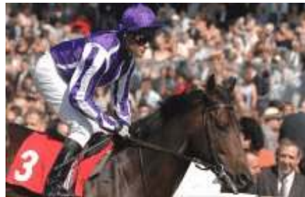
Eagle Mountain

Aidan O'Brien's quartet of winners in the G1 Racing Post Trophy includes subsequent Classic heroes High Chaparral (Ire) and Brian Boru (GB), and Eagle Mountain (GB) (Rock of Gibraltar {Ire}) carries the main Ballydoyle hopes in today's renewal at Newbury. Switched from Doncaster due to that track's redevelopment, the race