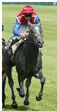
Garnica at Chantilly