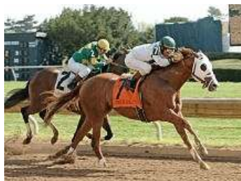
Clock Stopper