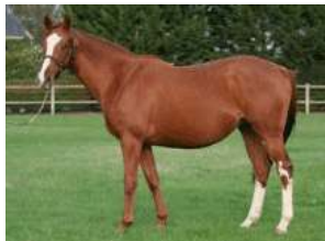
Exciting Times