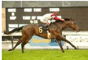
Badge of Silver