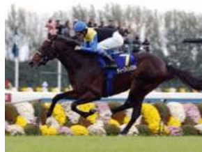
Deep Impact