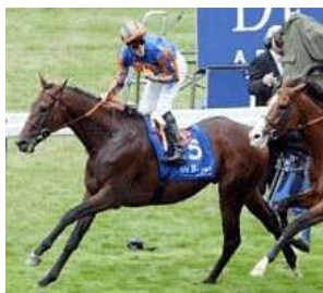
Hurricane Run

Four new stud prospects will be added to Coolmore's stallion team when George Washington (Ire) (Danehill--Bordighera, by Alysheba), Hurricane Run (Ire) (Montjeu {Ire}--Hold On {Ger}, by Surumu {Ger}), Aussie Rules (Danehill--Last Second {Ire}, by Alzao) and Ad Valorem (Danzig--Classy Women, by Relaunch) retire following their final outings on Breeders' Cup day at Churchill Downs Nov. 4. "These are four seriously well-bred horses, by the right sires, from top-class families and all have excelled at the very highest level on the racecourse," said