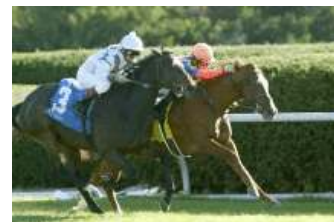
Gorella (inside) wins her third straight Pat Lang