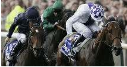
Teofilo (right) gets the better of Holy Roman Emperor

As in some of the greatest bouts in boxing history, the result between Teofilo (Ire) (Galileo {Ire}) and Holy Roman Emperor (Ire) (Danehill) went down to the final bell, but it was the former who had the count to win an epic renewal of the G1 Darley Dewhurst S. yesterday at Newmarket. After a pulsating final 100 yards, when