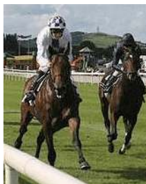
Teofilo (left)

Jim Bolger's Teofilo (Ire) (Galileo {Ire}) bested Susan Magnier's Holy Roman Emperor (Ire) (Danehill) by just 1 1/4 lengths when they met in the Sept. 17 G1 National S. at The Curragh. They square up again in today's G1 Darley Dewhurst S. at Newmarket, but Bolger is not predicting an instant replay of that event. "We are running and competing tomorrow, so we will have to wait and see how [Teofilo] gets on," Bolger told PA Sport . "It is a very good race, but you would expect that of a Group 1."