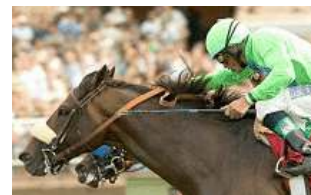
A.P. Warrior

He comes off a second-place effort in the Sept. 3 GII Del Mar Derby. A.P. Warrior was the pacesetter when second in the June 17 GIII Affirmed S. and third in the July 8 GII Swaps BC S. but came from just off the leaders when making his turf bow in the Aug. 12