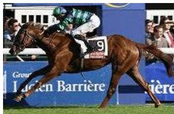
Finsceal Beo