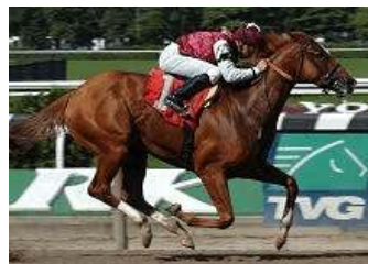
Allude

Meadow Breeze is the most well-travelled member of this field, with her six starts coming over four different racetracks. In her most recent outing, the chestnut pulled off a 34-1 upset in the GI Matron S. Sept. 23, and stretches out to a mile from that seven-furlong contest. Making the jump from maiden wins to Grade I company are Allude and Awesome Ashley . Allude,