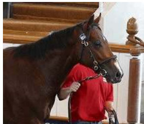
Lot 1616 - Beat Hollow colt