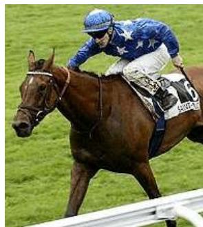
Pride

N P Bloodstock's Pride (Fr) (Peintre Celebre) steps onto hallowed ground today. She bids to follow in the steps of such famed distaffers as Time Charter (GB), Pebbles (GB), Triptych, Indian Skimmer, Bosra Sham and Alborada (GB) and capture today's G1 Emirates Airline Champion S. at Newmarket. Her development into one of France's leading middle-distance performers has been stealthy, but at the ripe age of six she is at her peak, running Rail Link (GB) to a neck when second in the G1 Prix de