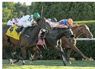
2005 QEII Cup (rail out) Gorella, Sweet Talker, Karen's Capar

In the 2005 GI Queen Elizabeth II Challenge Cup, the three-horse blanket finish was comprised of Sweet Talker , Karen's Capar and Gorella . Those fillies will all