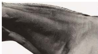
Cape Cross: 340k colt and filly

Bygone Days, a smart handicapper when trained by William Haggas, was purchased by Godolphin following his success at Haydock last September. Placed in handicaps on Nad Al Sheba's turf during the winter, he signed off on his Spring Carnival stint with a second to Candidato Roy Mar. 9. He returned to best the Ayr Gold Cup scorer Fonthill Road (Ire) in a conditions event at Hamilton last time Sept. 25 and made another stride forward here to open his stakes account. Settled in behind the early leaders by Frankie Dettori, he was presented with perfect fractions by stable rabbit Great Britain (GB) (Green Desert) and swooped late to inhale Borderlescott in the final strides. "He won very well and we'll look forward to seeing how he gets on in better races," trainer Saeed bin Suroor commented. "The ground helped him and he's always shown plenty of speed and a turn of foot. We'll take him back to Dubai now." Click for the Racing Post chart.