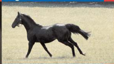
Singspiel: 190k filly

They say breeding horses is a numbers game. Tatts proved one thing above all else: this is the number you need: +44 (0)1638 730070.