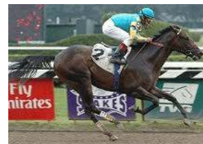
Got the Last Laugh