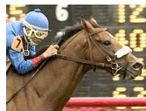
Vacare

Germance comes in from France with a glittering record. The bay reeled off four straight victories to begin her career, culminating in the G1 Prix Saint-Alary May 21 at Longchamp. Her unbeaten record came to an end when she ran second in the G1 Prix de Diane June 11, but, after a summer break, she rebounded to take the G3 Prix de la Nonette Aug. 20. After careful consideration, her connections opted for this race over the G1 Prix de l'Arc de Triomphe or the G1 Prix de l'Opera, both of which were run two weeks ago at Longchamp. An unbeaten filly based at Arlington Park looms an intriguing dark horse. Vacare ran past her rivals to land her June 9 debut at the Chicagoland oval. She resurfaced with a 5 3/4-length allowance tally July 26, then