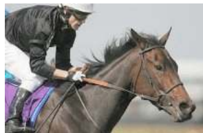
Ouija Board

Lord Derby's Ouija Board (GB) (Cape Cross {Ire}) will forego tomorrow's G1 Emirates Airlines Champion S. at