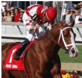
Master Command

He came back to wire the field in the May 20 GIII W.D. Schaefer H. at Pimlico, but failed to factor when sixth in the July 1 GII Cornhusker BC H. at Prairie Meadows. Given a short break after that race, the chestnut colt was gaining on Park Avenue Ball when third behind that rival in the Aug. 19 GIII Iselin BC H. at Monmouth, and gets a six-pound weight shift in his favor here. Park Avenue Ball was picking up his third win from five 2006 starts in the Iselin, but could do no better than second as the 4-5