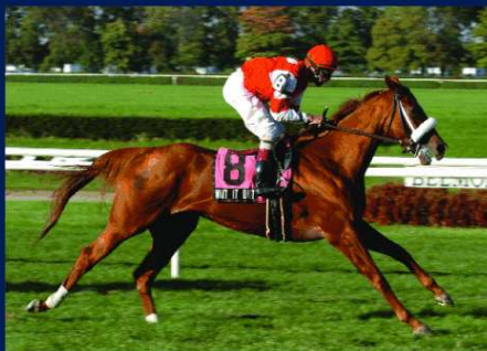
10/6 France...2YO MAKAAN wins Prix Thomas Bryon-G3