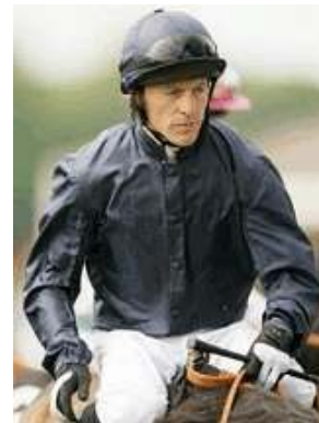
Kieren Fallon