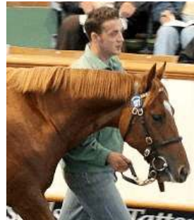
Hip 1177